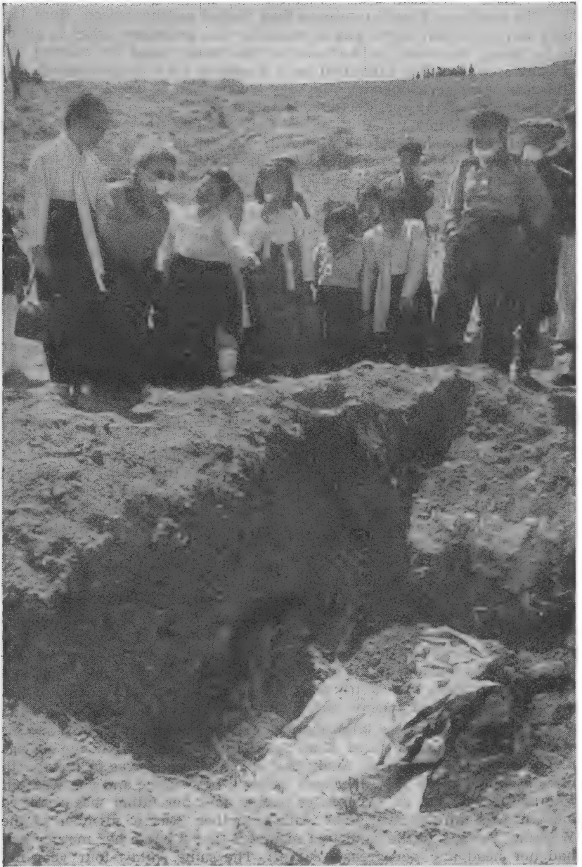
Anak Here again they found bodies of children